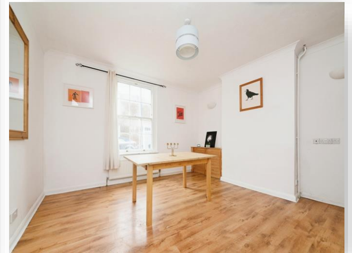
South Everard Street, King's Lynn, PE30 5HJ