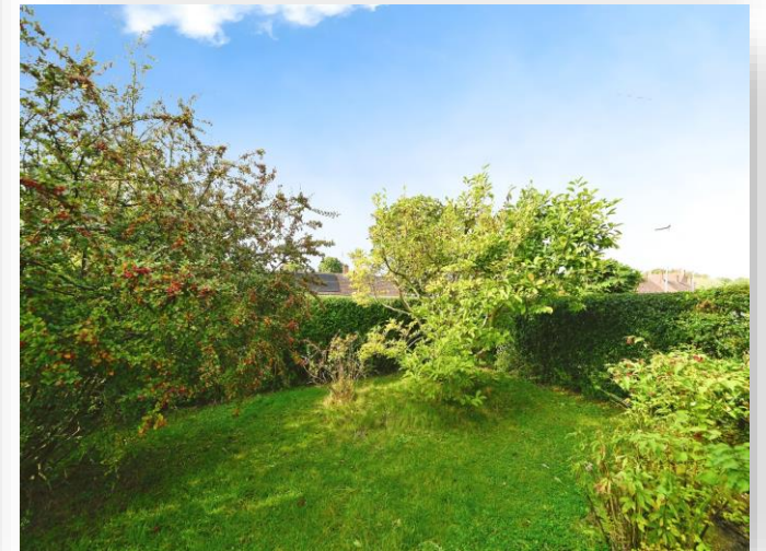
Parkway, Gaywood, King's Lynn, PE30 4PE