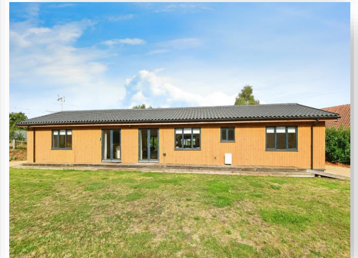
Pentney Lakes, Common Road, Pentney, King's Lynn, PE32 1LE