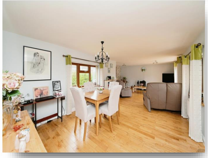
Nursery Lane, South Wootton, King's Lynn, PE30 3LB