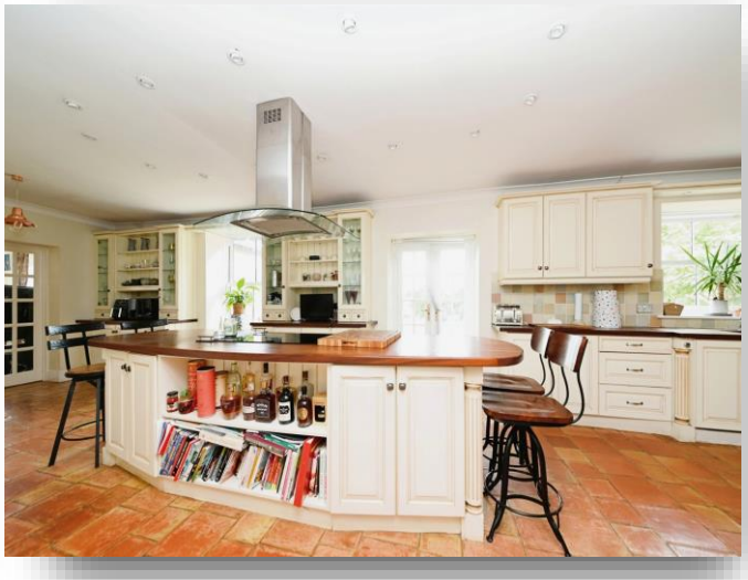
Holland House, Lynn Road, East Winch, KING'S LYNN, PE32 1NG