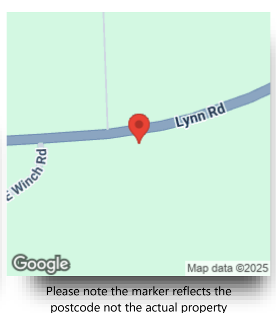
view this property online williamhbrown.co.uk/Property/KLN118450