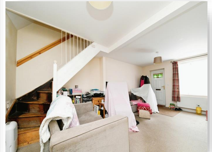
Rose Cottage, Marshland Street, Terrington St. Clement, King's Lynn, PE34 4NE