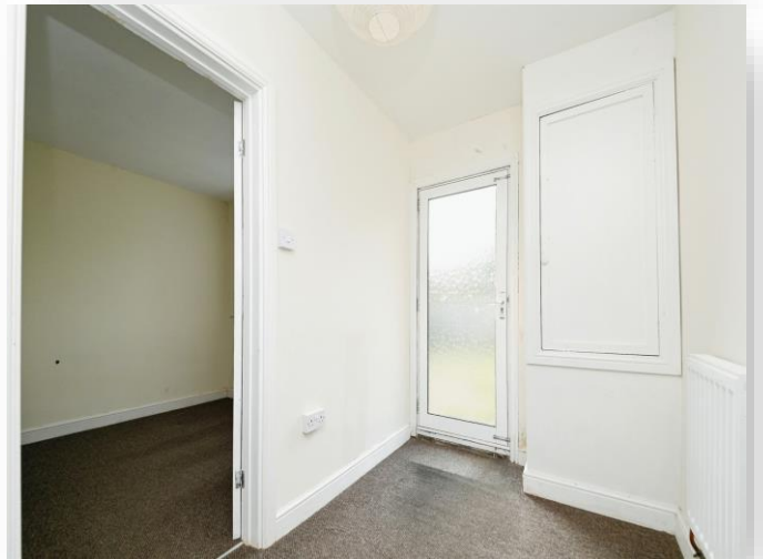
Lady Jane Grey Road, King's Lynn, PE30 2NT