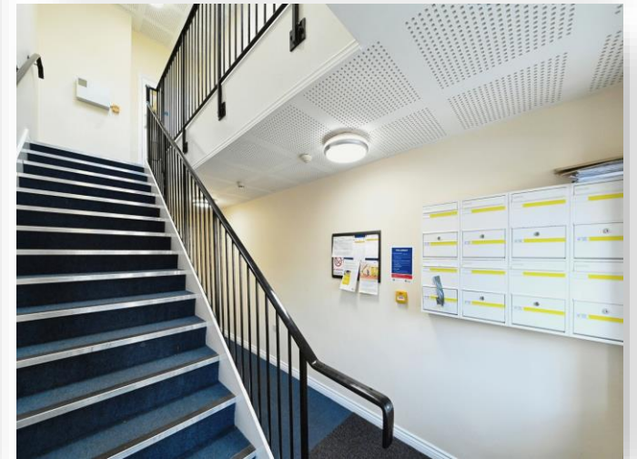
Savage Close, King's Lynn, PE30 4BG