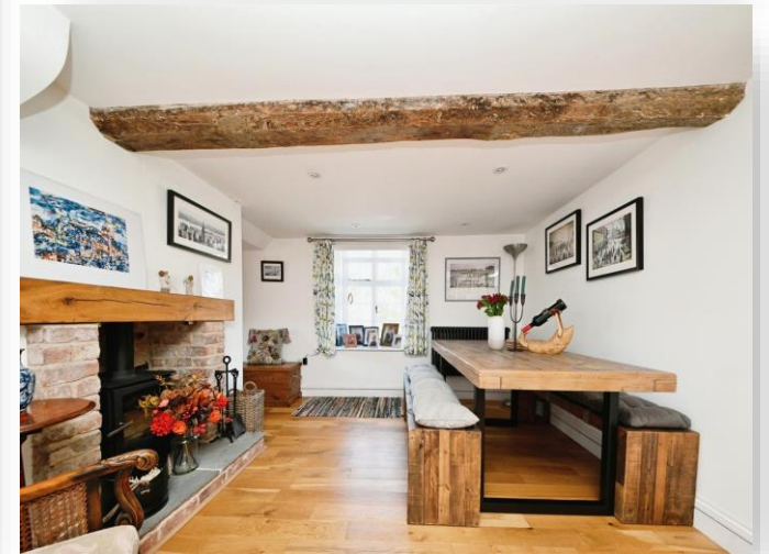
White House Farm, Chapel Road, Pott Row, King's Lynn, PE32 1DZ