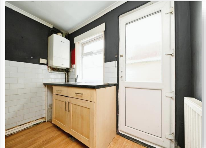
Archdale Street, King's Lynn, PE30 1QY