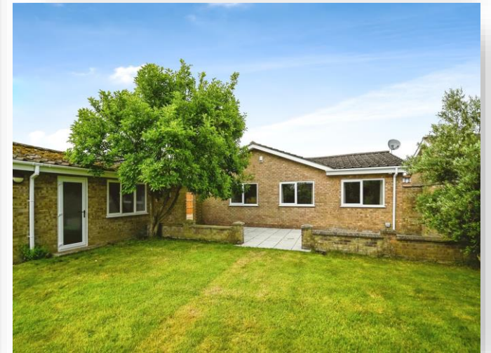
Birch Grove, West Winch, KING'S LYNN, PE33 0PQ