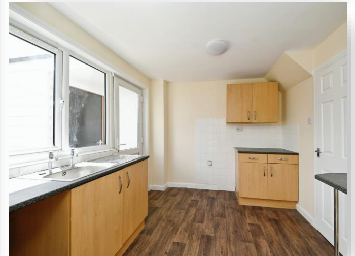
Copperfield, King's Lynn, PE30 4RA