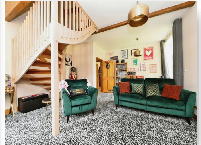
School Barn, Sandy Lane, Blackborough End, King's Lynn PE32 1SE