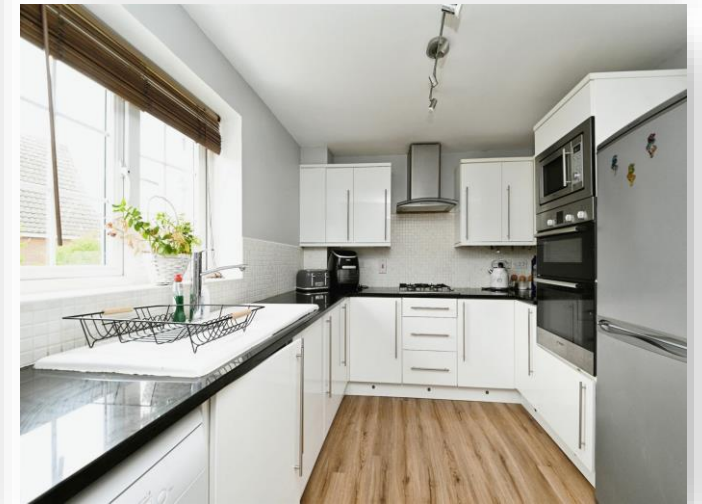
Deas Road, South Wootton, King's Lynn PE30 3PE