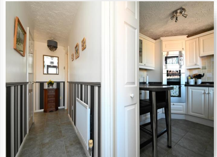
Pell Place, West Winch, King's Lynn PE33 0SP