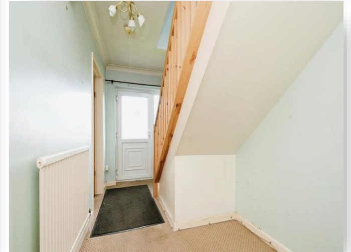
River Lane, Gaywood, King's Lynn PE30 4HD