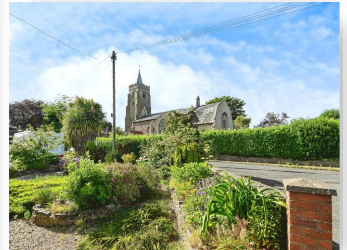
Cherry Tree Drive, West Lynn, King's Lynn, PE34 3LA