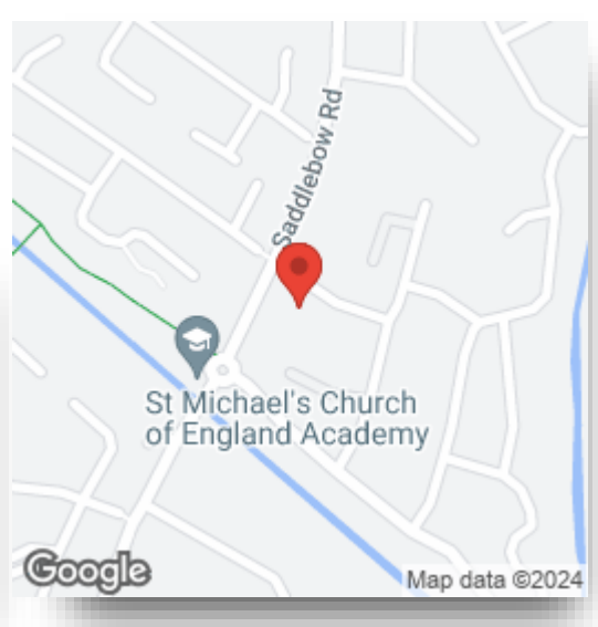
Please note the marker reflects the postcode not the actual property