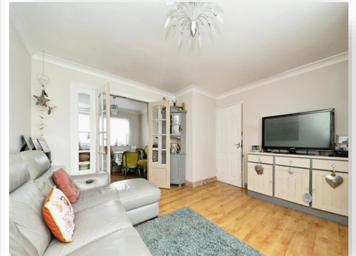
Silver Green, King's Lynn, PE30 4SG