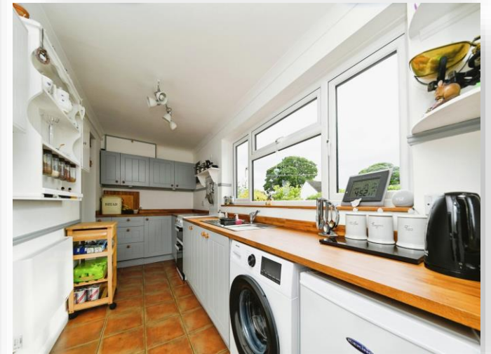
Low Road, Walpole Cross Keys, King's Lynn PE34 4HA