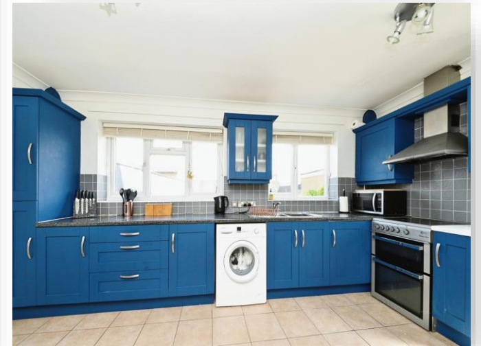
Peckover Way, South Wootton, King's Lynn PE30 3UE