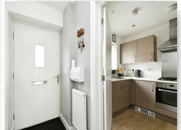
Winter Nelis Way, King's Lynn PE30 3FD