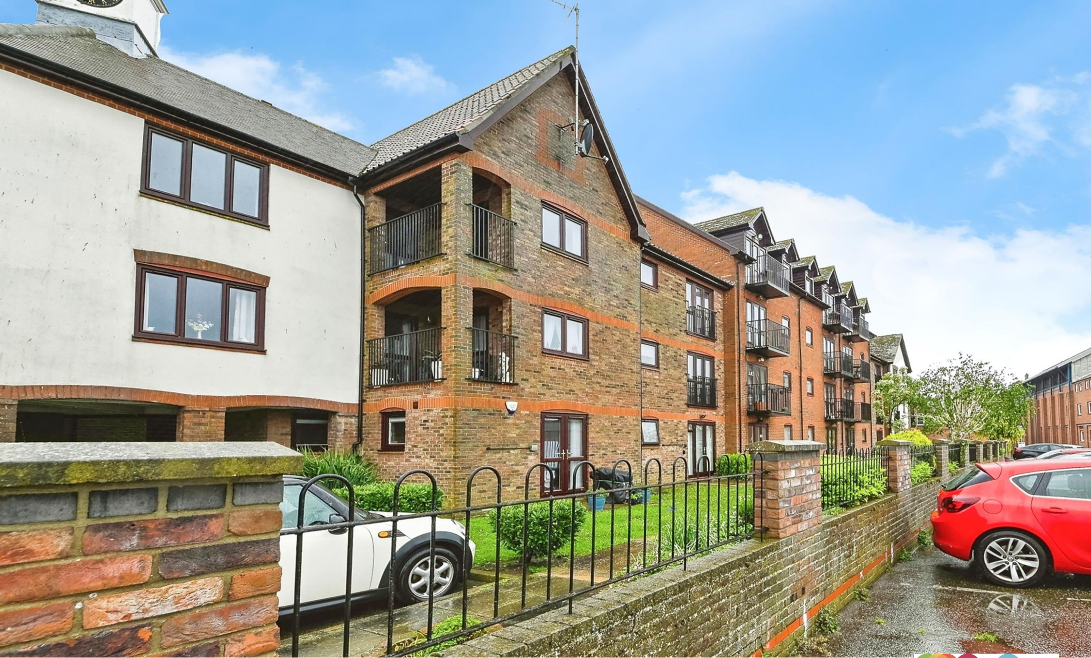
Trinity Quay, Page Stair Lane, King's Lynn, PE30 1NQ