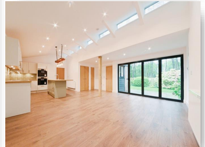
Park Hill, Middleton, King's Lynn, PE32 1RJ