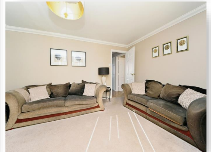
Fuller Close, West Winch, King's Lynn PE33 0UD