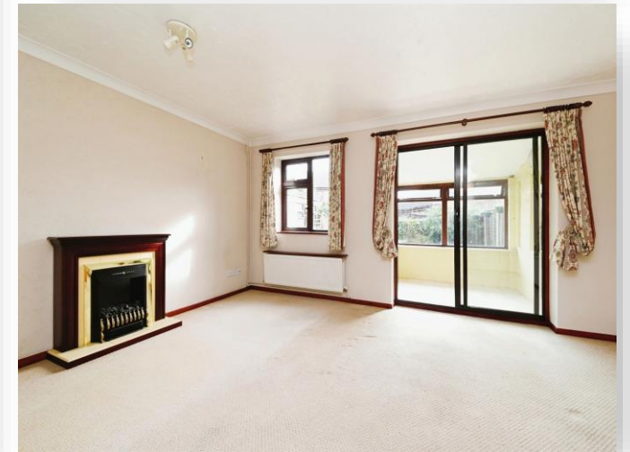
Wootton Road, King's Lynn, PE30 3BG