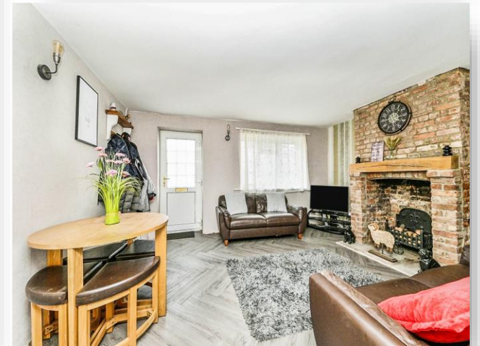
Marshland Street, Terrington St. Clement, King's Lynn, PE34 4NE