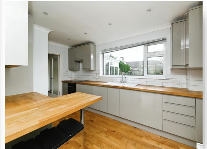
Laurel Grove, West Winch, King's Lynn PE33 0PL