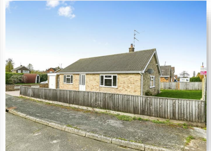
Oxford Place, Terrington St. Clement, King's Lynn PE34 4LB