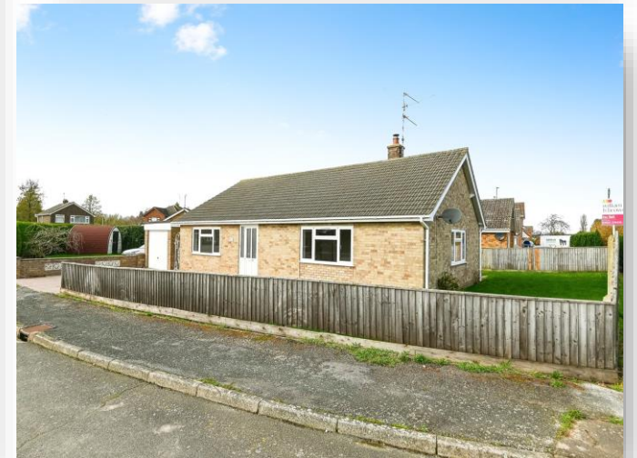
Oxford Place, Terrington St. Clement, King's Lynn PE34 4LB