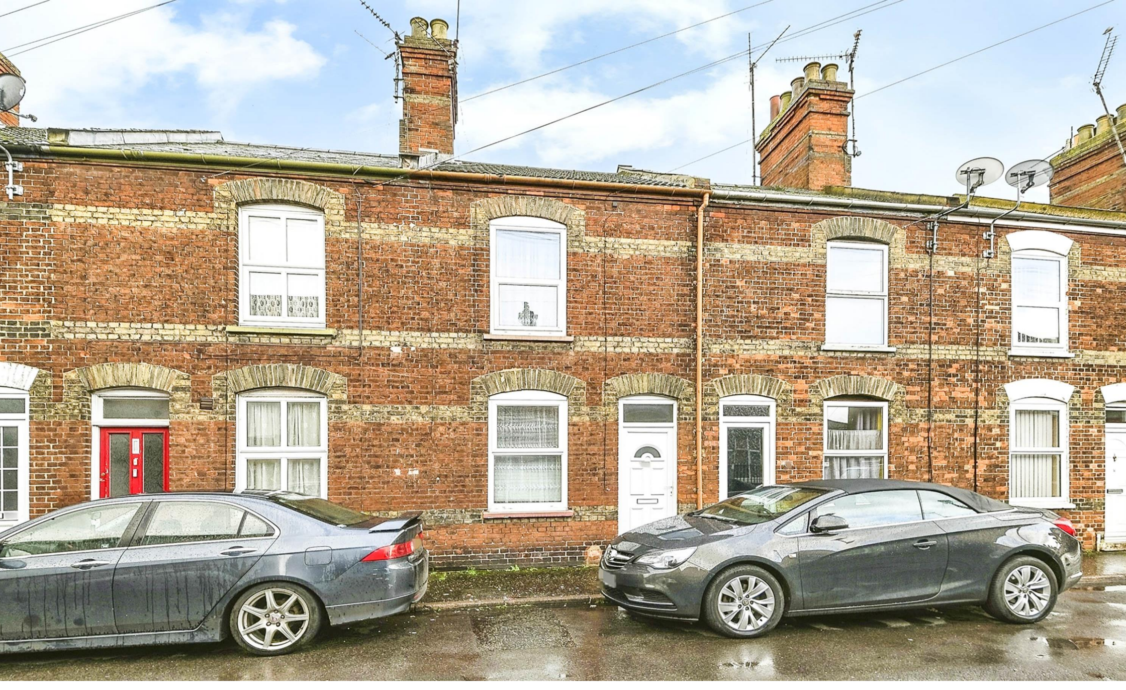
Sir Lewis Street, King's Lynn PE30 2AH