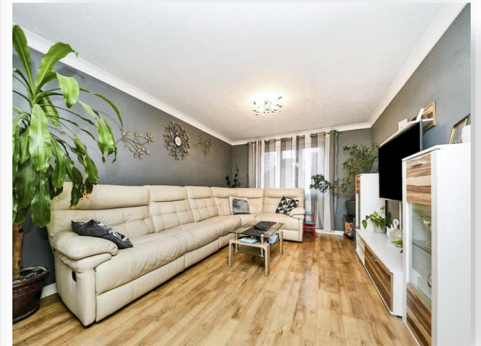
Brellows Hill, Terrington St. Clement, King's Lynn, PE34 4PF