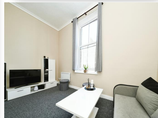
The Stables, Valingers Road, King's Lynn, PE30 5HD