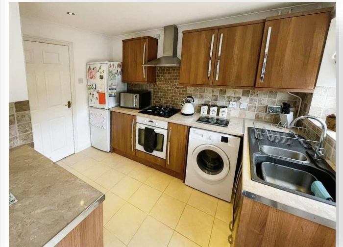
Blick Close, West Winch, King's Lynn, PE33 0UA