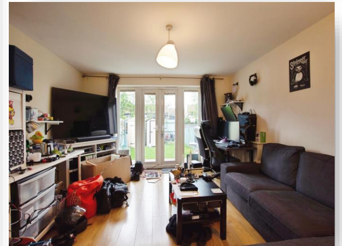
James Street, Leabrooks Alfreton DE55 1LW