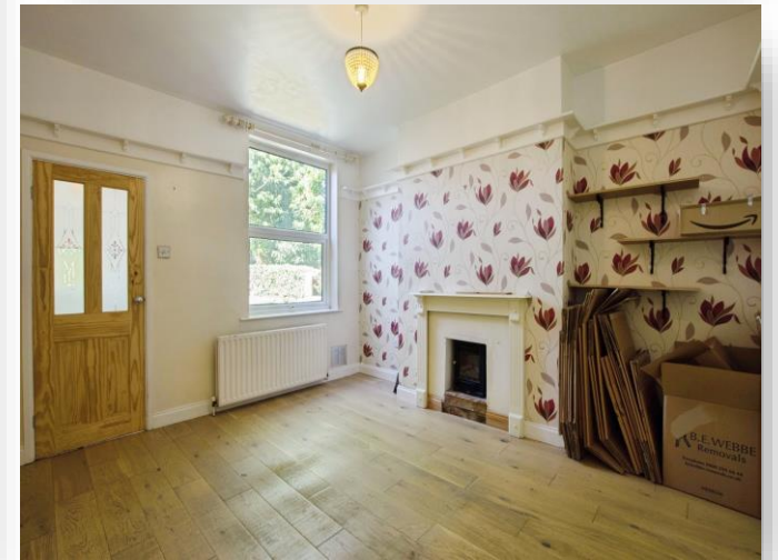
Hilcote Street, South Normanton Alfreton DE55 2BQ