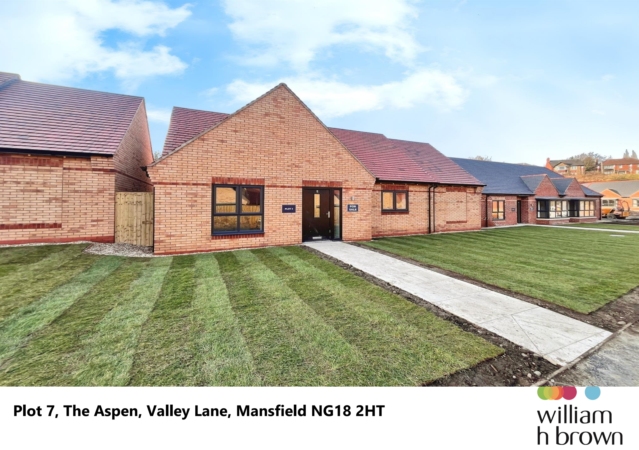
Plot 7, The Aspen, Valley Lane, Mansfield NG18 2HT