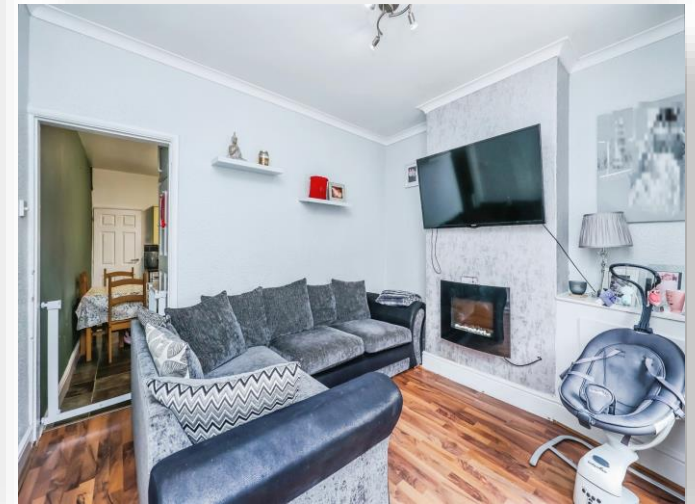
Abbott Street, Awwsworth Nottingham NG16 2QJ