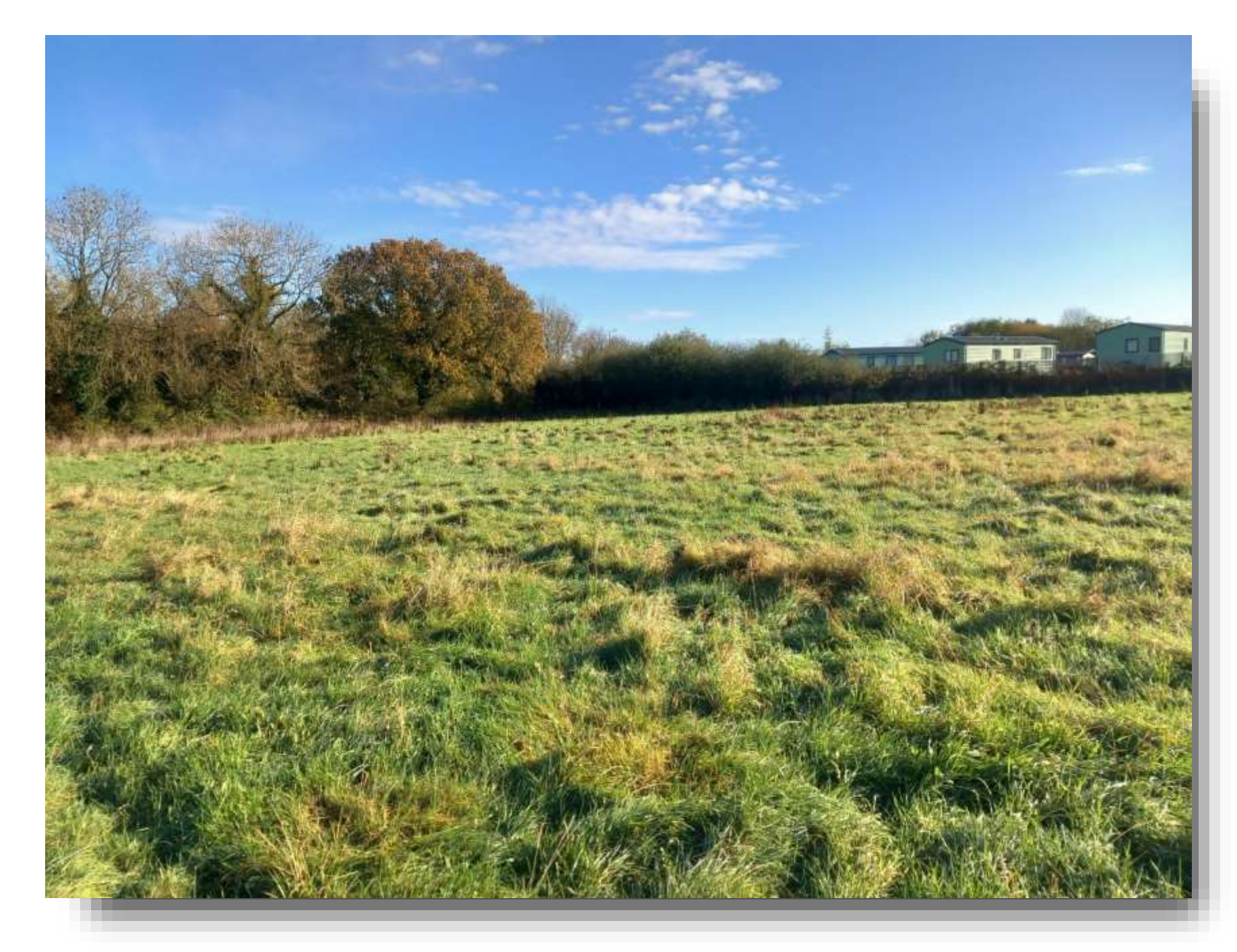
Silverhill Lane, Teversal Sutton-In-Ashfield NG17 3JJ