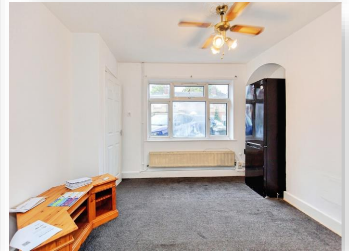
Rosewood Place, KETTERING NN16 9PY