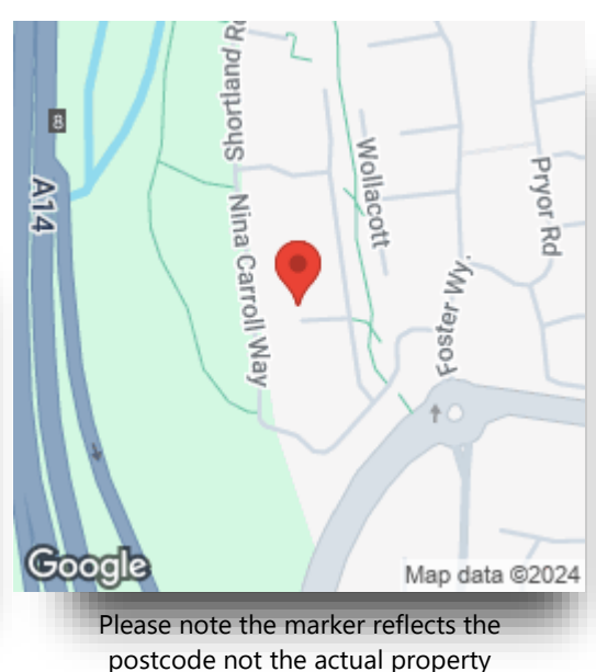
view this property online williamhbrown.co.uk/Property/KTG110980