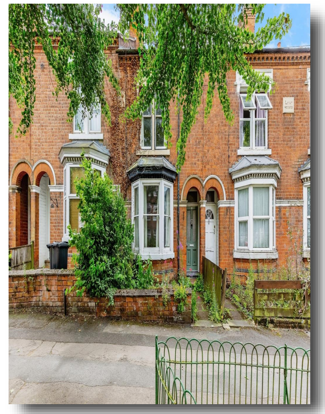
Bowling Green Road, Kettering NN15 7QN