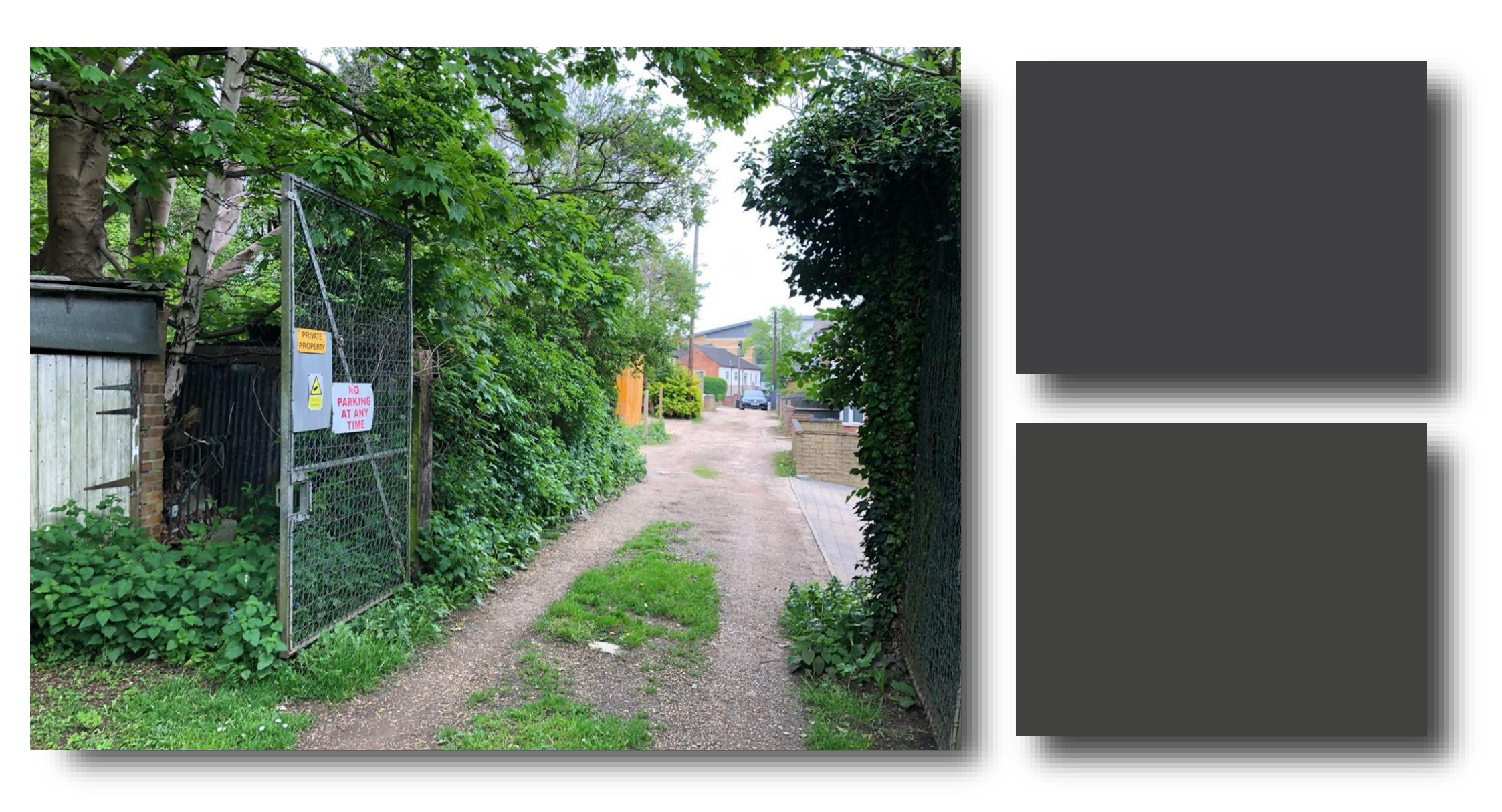
Plot 3 Railway View, Kettering NN16 8EA