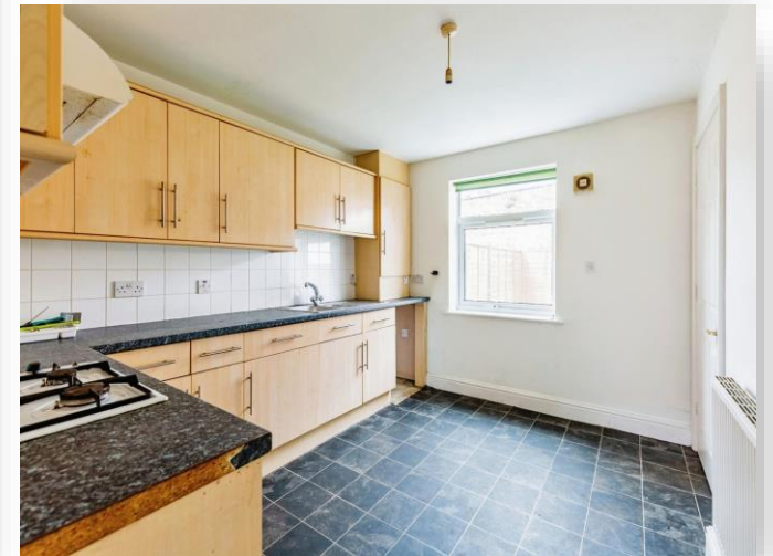
Woodlands Court Wood Street, Kettering NN16 9SD