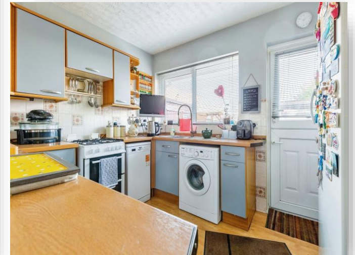
Alledge Drive, Woodford Kettering NN14 4JQ