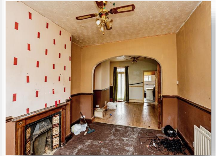
William Street, Kettering NN16 9RS