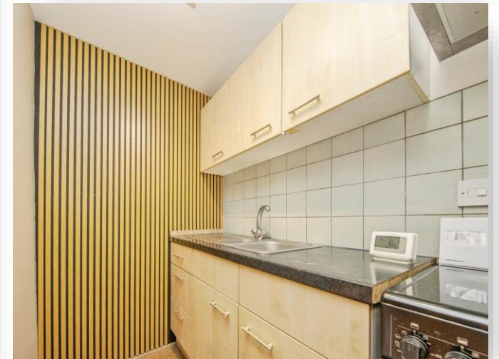
Basement Flat, Cemetery Road, Ipswich, IP4 2HN