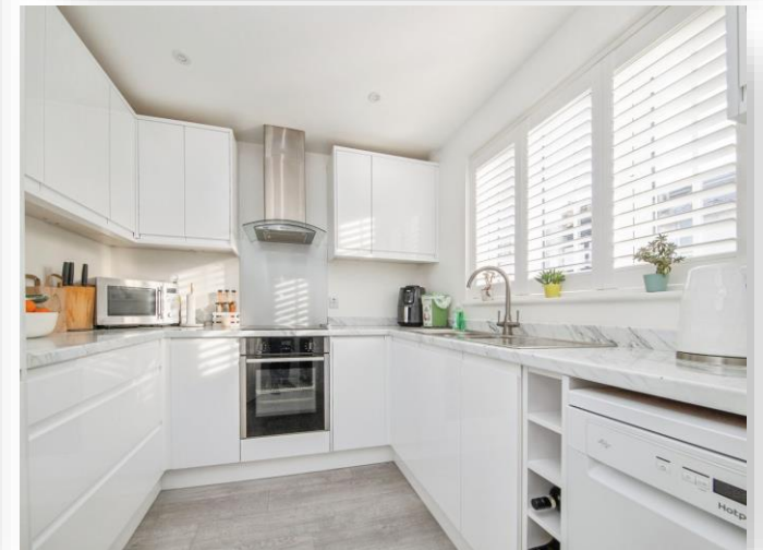
Fuchsia Lane, Ipswich, IP4 5AA