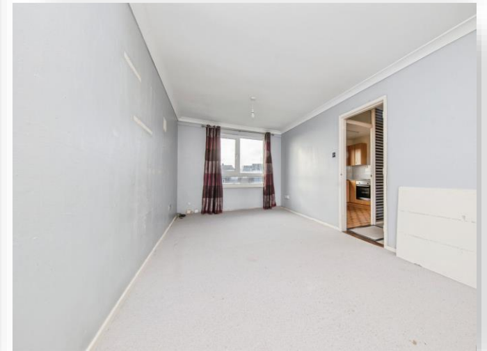
Hale Close, Ipswich, IP2 9QP