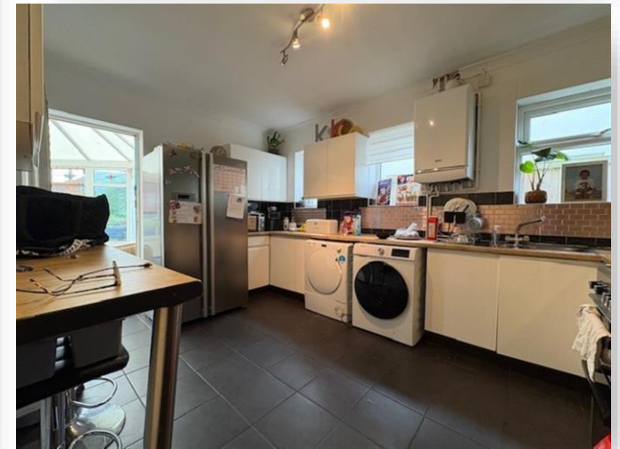
Rubens Road, Ipswich, IP3 0RJ